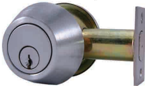
D2-S Single Cylinder