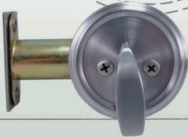
2" ADA Approved Thumb Turn with 3/32" Steel Mounting Plate