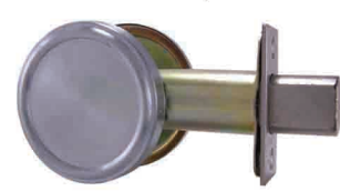
D2-TBP Thumbturn x Blank Plate