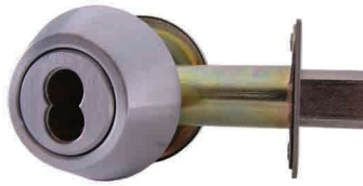
D2-S-IC Single Cylinder