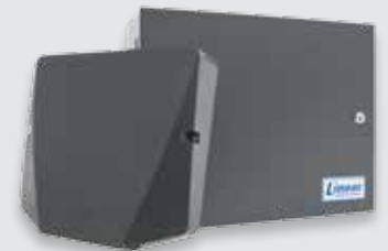
eMerge Essential & Elite | 1 to 200 Doors