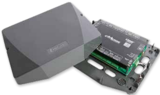
Essential™ or Elite™ in Compact Case