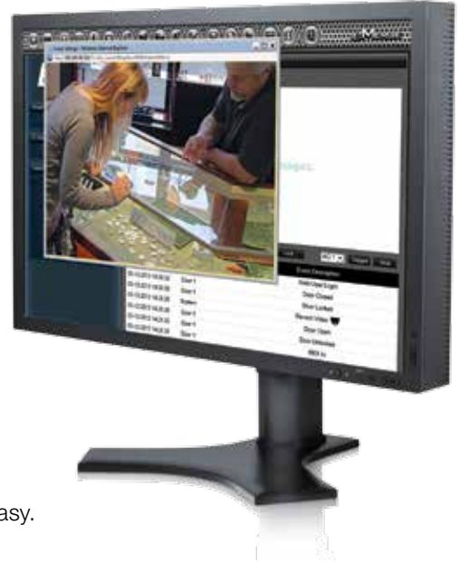
Experience E3! Fast, Intuitive, Easy-To-Use