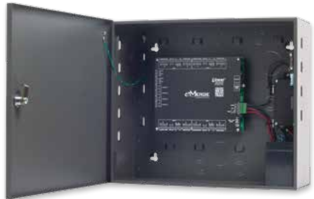
Essential Plus™ or Elite™ in Metal Cabinet (UL 294 Certified)